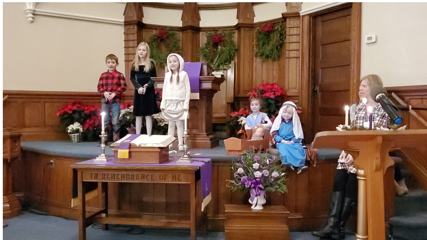
Children's Choir on December 22, 2019