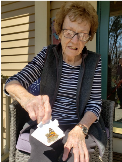
A butterfly from Easter Sunday.