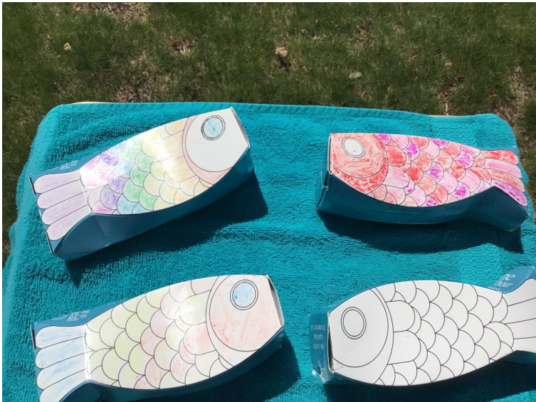
"The children raised $97.12 for the One Great Hour of Sharing."